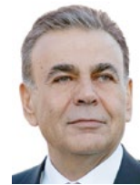
AZİZ KOCAOĞLU Metropolitan Mayor of İzmir Chairman of IZFAŞ